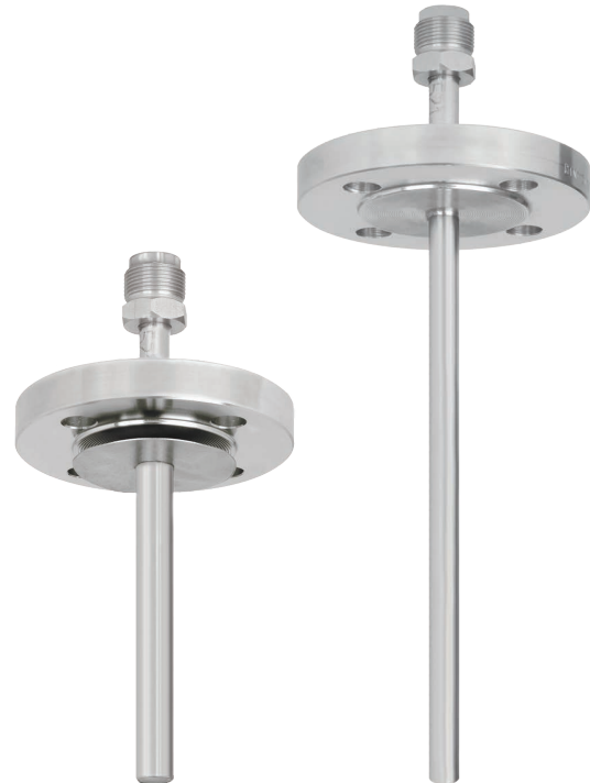
Fig. left: Thermowell with tantalum cover, version TW40-E

Furthermore, one can differentiate between fabricated and solid-machined thermowells. Fabricated thermowells are constructed from a tube, that is closed at the tip by a welded solid tip. Solid-machined thermowells are manufactured from solid bar stock.