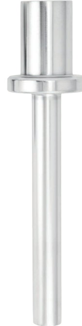
Thermowell for lap flanges, model TW30